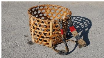
Japanese Bamboo Basket

Can you recall the function or purpose of these crafts? Write them under each column.