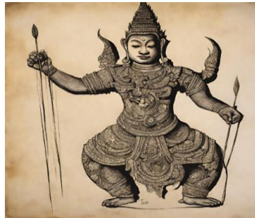
Image source: AI Generated Sketch of Shadow Puppet for Nang Talung. https://www.canva.com/design/DAGBy1LoYns/HY0jNiC0dH0wnPUAxyK94A/edit?utm_content=DAGBy1LoYns&utm_campaign=designshare&utm_medium=link2&utm_source=sharebutton

4. Here are the key characters for the performance: