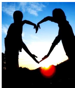
"Love" by Shena Pamella is licensed under CC BY-NC-SA